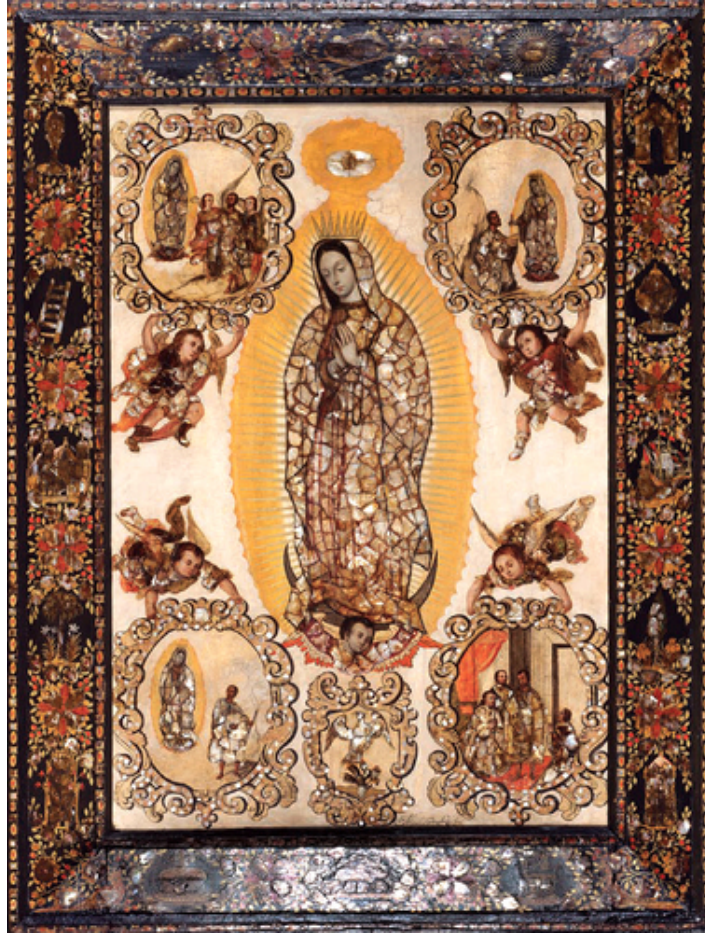
Figure 2. Miguel González, Our Lady of Guadalupe , oil and mother-of-pearl on wooden panel, 17 th century, Los Angeles County Museum of Art