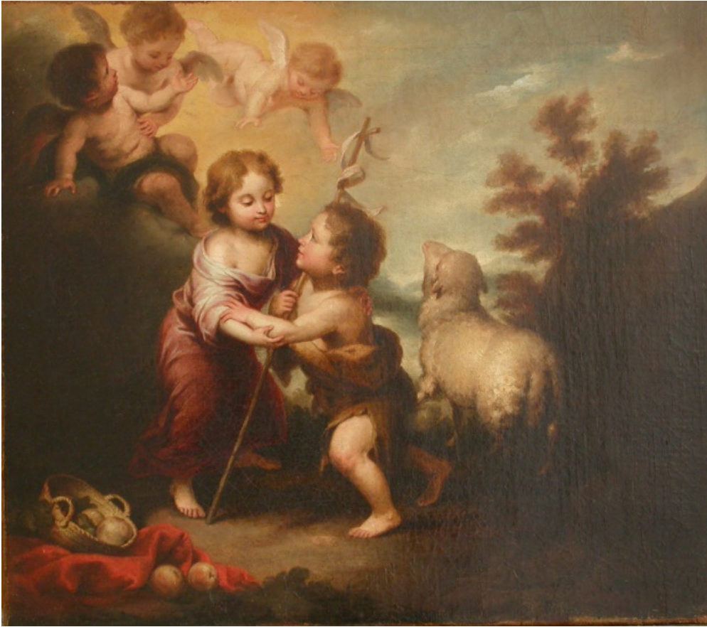
Figure 1. Bartolomé Esteban Murillo, Infant Jesus and Infant John the Baptist , oil on canvas, 17 th century, Colección F. Bonilla-Musoles, Valencia